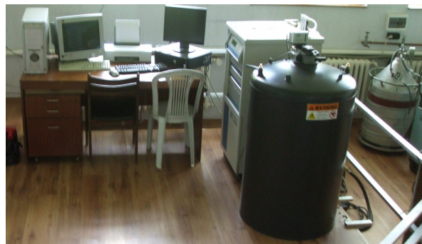
Fig. 4 Physical Properties Measurements System (USA) for materials characterization at the ISSP-BAS. The apparatus is delivered in 2009.

More difficult is the implementation of superconductivity in different fields of activity in the country. The first scientific apparatus consisting of superconducting magnet were supplied to the Institute of Organic Chemistry with Centre of Phyto-chemistry (Bruker nuclear magnetic resonance spectrometer with 14 T magnet) and the Institute of Solid State Physics at the BAS (Physical properties measurements system with 9 T magnet) (see Fig. 4). In the past 10 – 15 years many apparatuses for Nuclear Magnetic Resonance for medical investigations have been bought (in Tokuda hospital, Losenetz hospital, Military hospital in Sofia and some hospitals in the country). Bulgarian Institute of Metrology plans to provide the voltage etalon based on the Josephson effect. Introducing the high-temperature superconductors in different apparatus