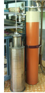
Fig. 2 Cryostat for investigations at liquid helium temperatures

In 1971 and 1983 Bulgaria hosted the 10 th and 21 st International conferences on Low temperature physics and techniques of countries from Council for Mutual Economic Assistance.